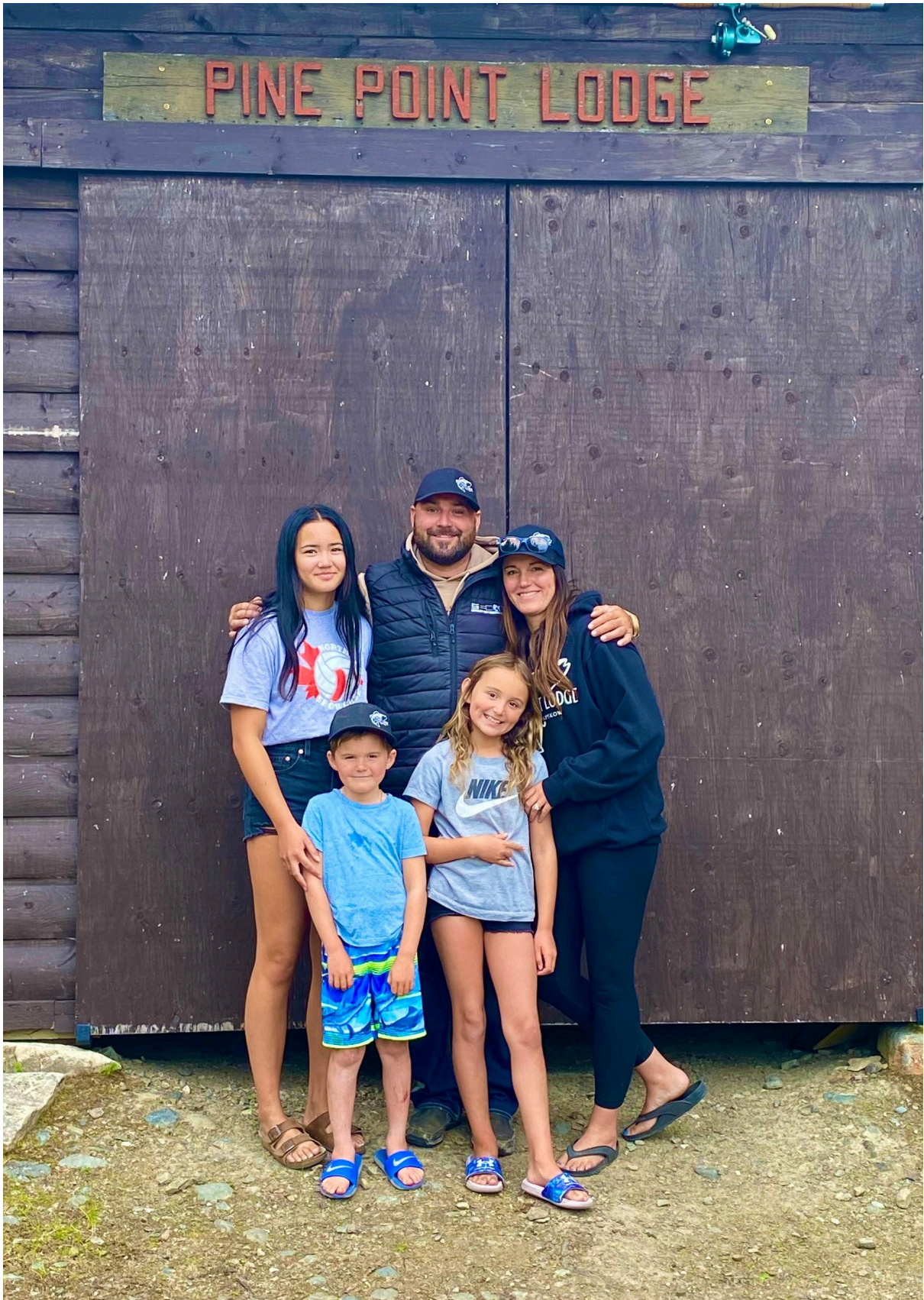
In 2025, devastating wildfires came within 15 feet of Pine Point Lodge. Thanks to the firefighters, along with my dad and a group of friends, the property was saved.